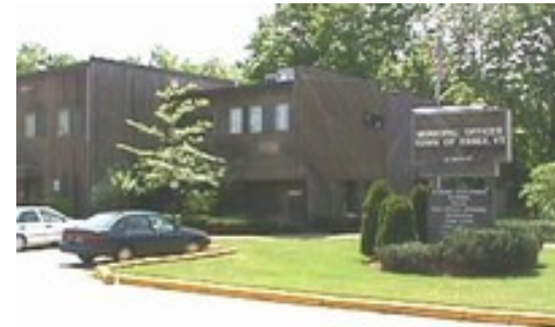
Essex, VT Town Offices

12 Questions? Email training@democracyforamerica.com