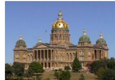
Iowa State Capitol

6 Questions? Email training@democracyforamerica.com