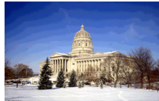
Missouri State Capitol