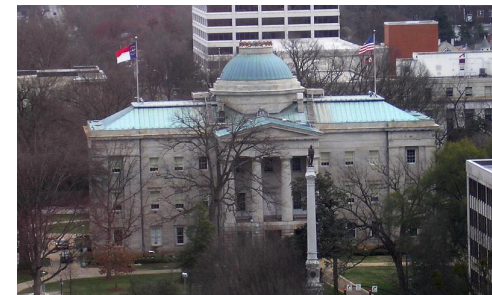
North Carolina State Capitol

10 Questions? Email training@democracyforamerica.com